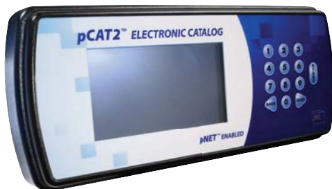
Customizable Graphic Front Panel

The pCAT2™ Electronic Catalog is the most advanced electronic catalog available. It is part of the RTC profitNETWORK™ shopper-focused technology system. It has a bright, easy to read screen and is remotely updateable via the pNET Manager™, so parts data is always up-to-date.